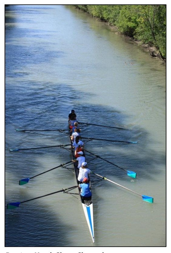
Rowing, North Shore Channel.

contamination that would affect the integrity of ecosystems; and 2. To eliminate lakewide fish consumption advisories due to toxic contaminants.