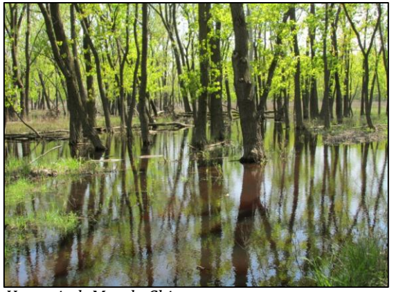
Hegewisch Marsh, Chicago

The differences among the three major sections of the Illinois Coastal Zone have led us to organize our planning around these geographic designations, in addition to considering issues at the level of the full Coastal Zone (Figure 3). This allows us to better target strategies, partnerships, and grants to the local priorities in each area. For example, while all three areas retain significant remnant coastal habitats, the types of habitats and their management needs are distinct. The Pike-Root includes high-quality natural area large,