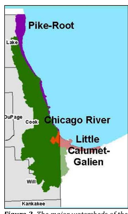
Figure 2. The major watersheds of the Illinois Lake Michigan coast. By comparing this map to Figure 1, it is evident that only a small portion of the Chicago River watershed is included within the Coastal Zone boundary.

The northern section of Illinois coast includes Pike-Root watershed which stretches from southeastern Wisconsin In this section of the Coastal Zone, the watershed covers over 105 square miles and contains 32 miles of Lake Michigan shoreline between Wisconsin border and Wilmette. The combined effects of the draining of the majority of the wetlands and stream channel manipulation have led to degraded water and habitat quality throughout the Pike-Root Basin. The watershed also includes Illinois' only Great Lakes Area of Concern (AOC) at Waukegan Harbor. Industrial