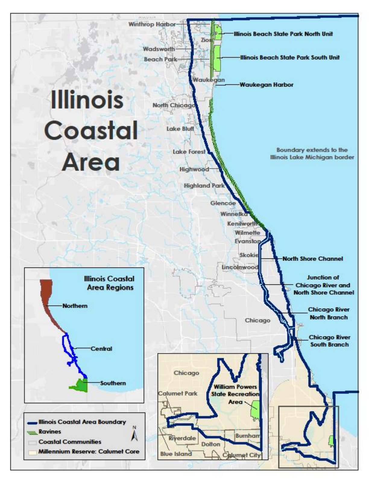
Figure 1. Illinois' Coastal Zone boundary, as approved by NOAA in 2012. Major communities partly or wholly within the Coastal Zone are listed.