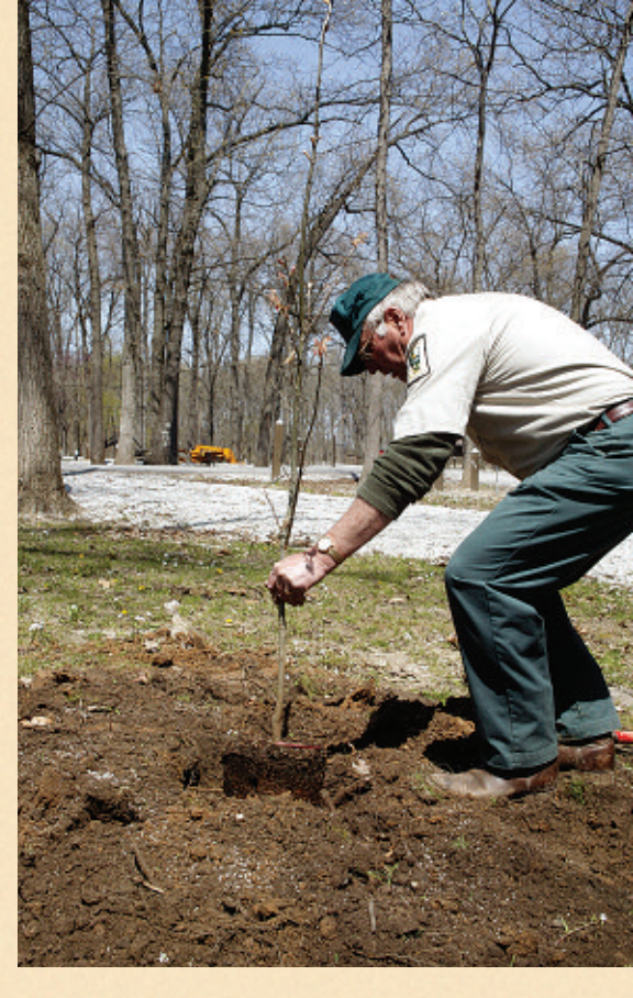
As dead, diseased and hazardous trees are removed, Beaver Dam State Park staff replace them with native oaks.

The scenic Macoupin Creek Valley where the park now sits has attracted humans for thousands of years. Native American hunting parties found plentiful wild game—deer, turkey, elk, bison, waterfowl-in the valley and several prehistoric camp sites and grave sites have been found along the waterway. Along the stream they also found bountiful, edible plants, like the roots of arrow arum, called by one tribe "ma-cou-pin-a" and the source of many place names in the area. A large, red, carved sandstone ceremonial pipe found in the area documents trading with Mayans during the mid-Mississippian culture.