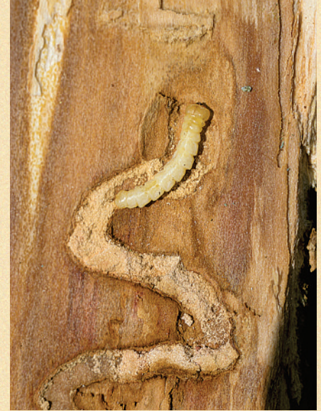
A larva leaves an S-shaped trail as it feeds beneath the bark of this ash.

IDA has identified four priority zones (illustrated) within the northern 35 coun-