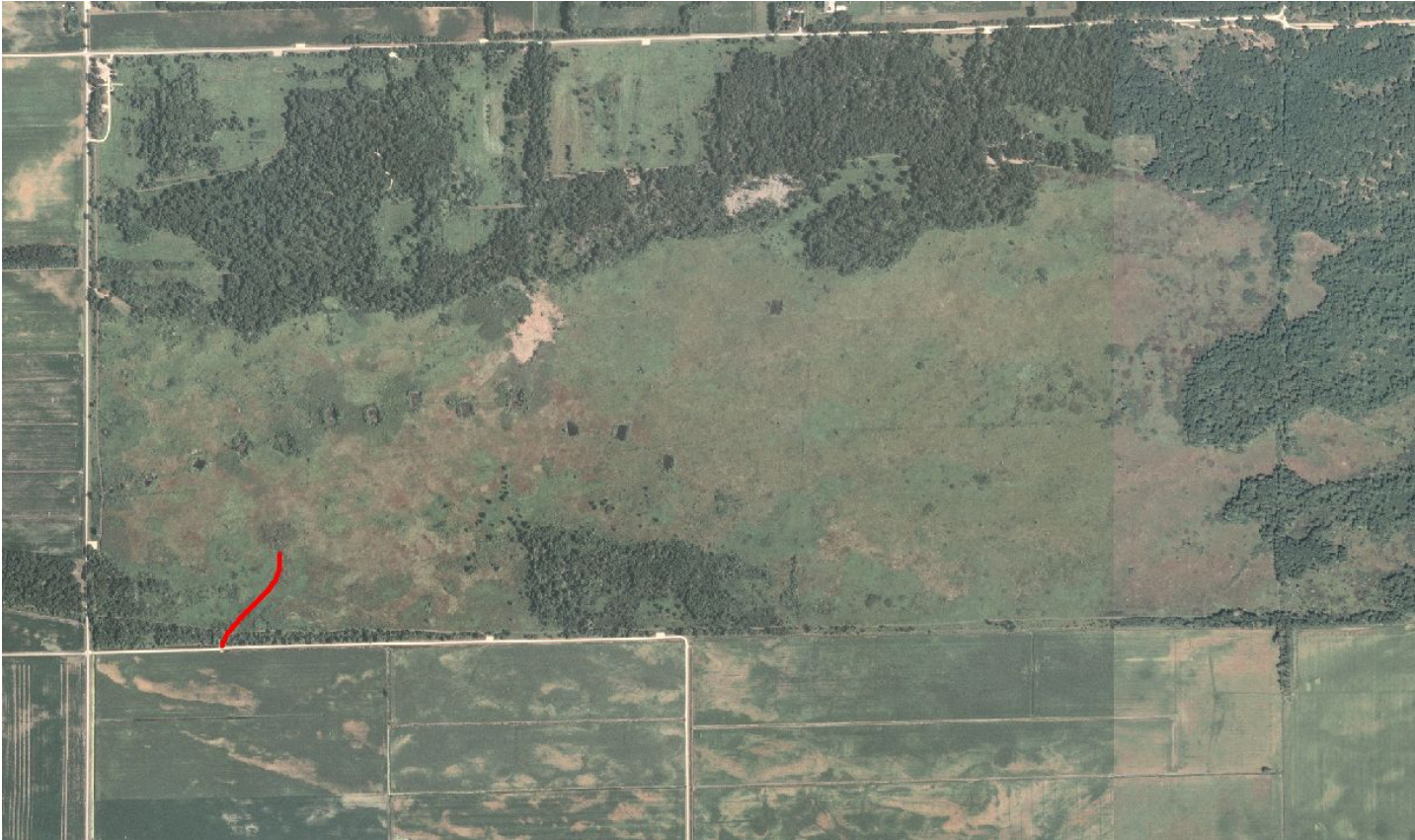
Figure 2. The ditch to be filled is located in the southwestern portion of Iroquois State Wildlife Area.