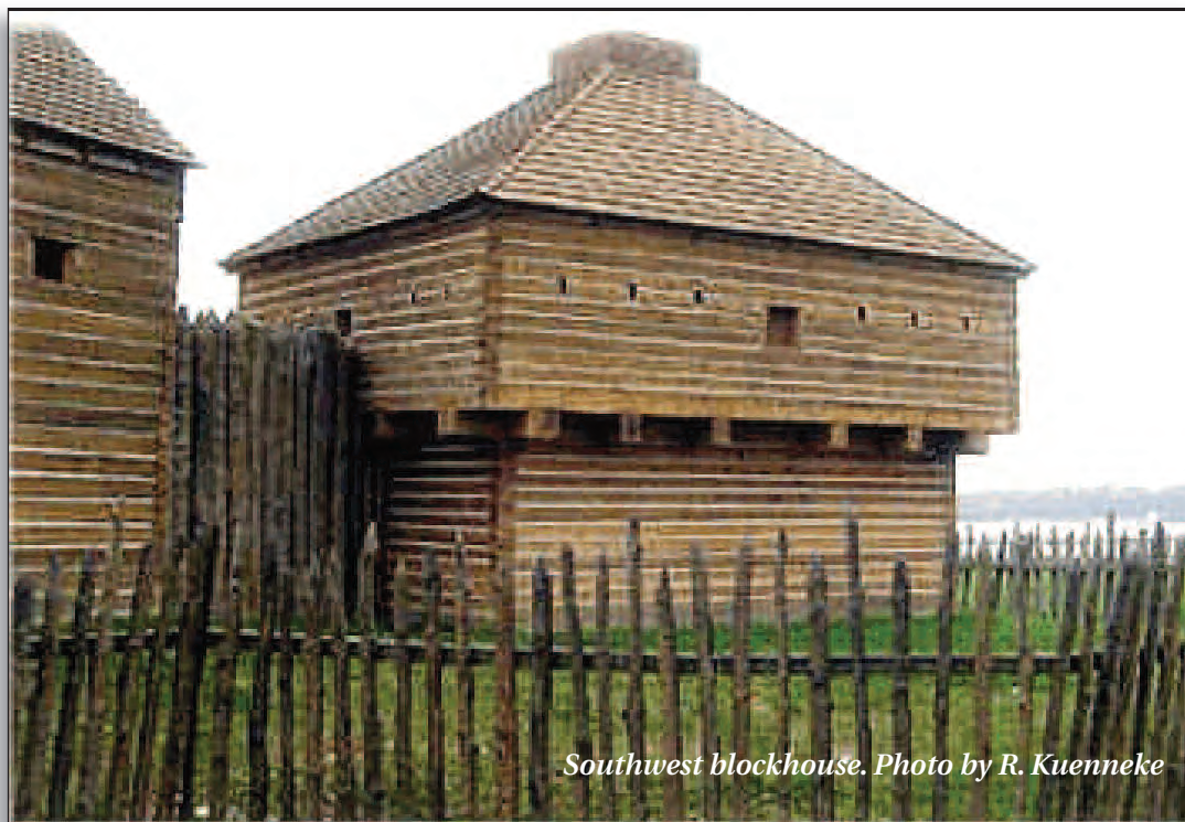
Southwest blockhouse.

The establishment in 1801 of Cantonment Wilkinson, overlooking the Ohio River some 16 miles down river from Massac, shifted mil-