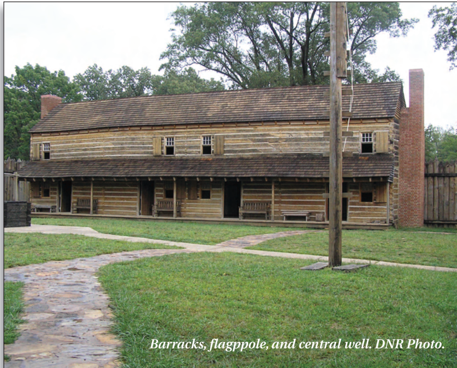
Barracks, flagpole, and central well.

A well surround (#15) is reconstructed in the center of the fort; another well was present in 1802 in the northeastern part of the fort. A trash pit and possibly a privy were located in the extreme northeastern corner. The brass-capped wooden flagpole (#16) is 35' tall. A rock drainage system (#17) was present within the northern half of the fort.