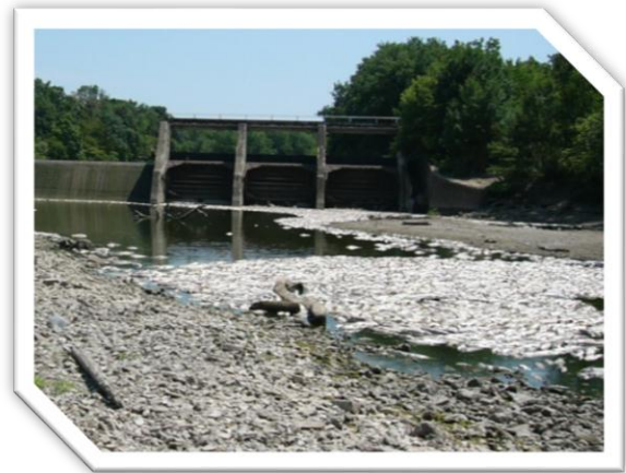
Figure 2: Fish Kill during the 2012 Drought

“The protection of minimum instream flows within the rivers and streams of Illinois is a significant water resources management issue that has been widely recognized since the mid 1970’s. With each new drought and burst of economic development and growth in Illinois, numerous additional demands for the offstream use of the State’s surface water resources occur. The development of these resources occurs across the State and can cause significant negative impacts to streams of any size and at any location. Without the provision for the protection of some levels of minimum streamflows, the resource values, uses, and benefits of these aquatic resources are significantly impaired. In addition, it is now becoming recognized that most of the streams in Illinois cannot meet the demands of all users at all times. Therefore, developers of the surface water resources of the State of Illinois must recognize the need to cease withdrawals at various times to protect the values of instream uses. They must also recognize that most water supply developments in Illinois will require that