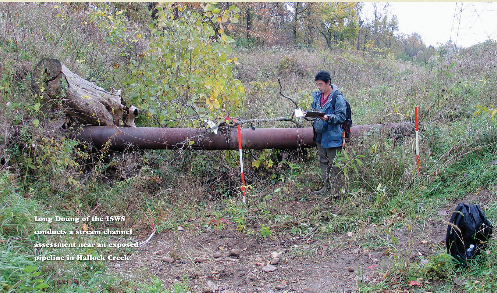
Long Doung of the ISWS conducts a stream channel assessment near an exposed pipeline in Hallock Creek.

Identification of degraded stream sections is used to support restoration of the Illinois River.