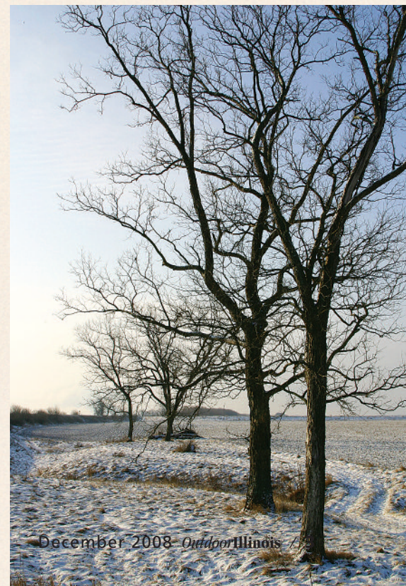
December 2008 Outdoor Illinois

The numbers alone are staggering. The historic bed of Thompson Lake—a lake which once spread across Emiquon but has not been seen in more than 80 years—began filling with water, first to 400 acres, then to more than 2,000. Tens of thousands of waterfowl, including 17 duck species, have taken to the waters as they migrate through Illinois. Other uncommon birds, like red-necked grebes and black-necked stilts, have been spotted along