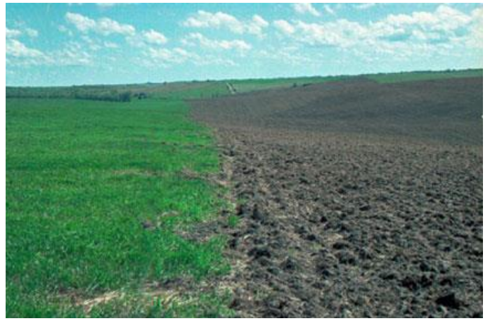
D/I Cool Season Grass (4/26/2011)