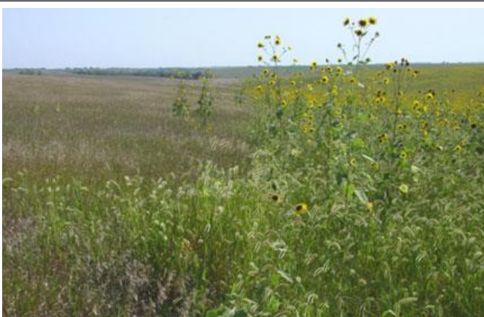
D/I Cool Season Grass (9/1/2011)