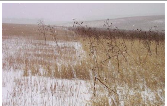
D/I Cool Season Grass (12/1/2011)