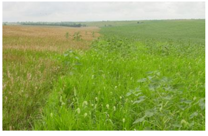
D/I Cool Season Grass (7/27/2011)