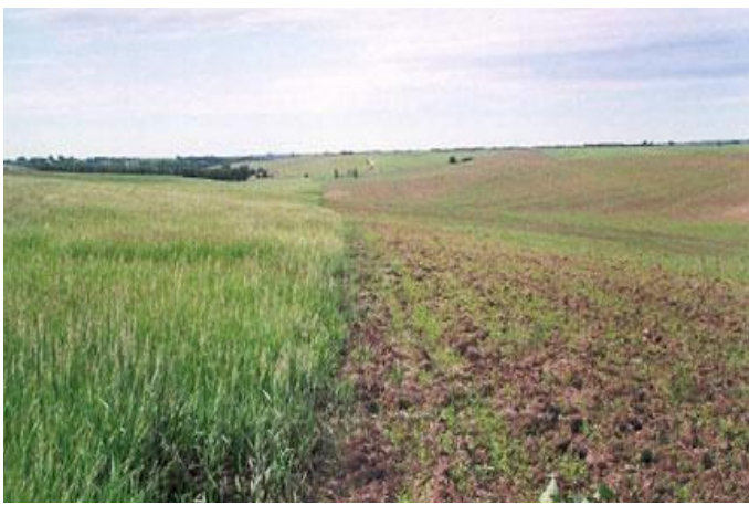
D/I Cool Season Grass (6/1/2011)