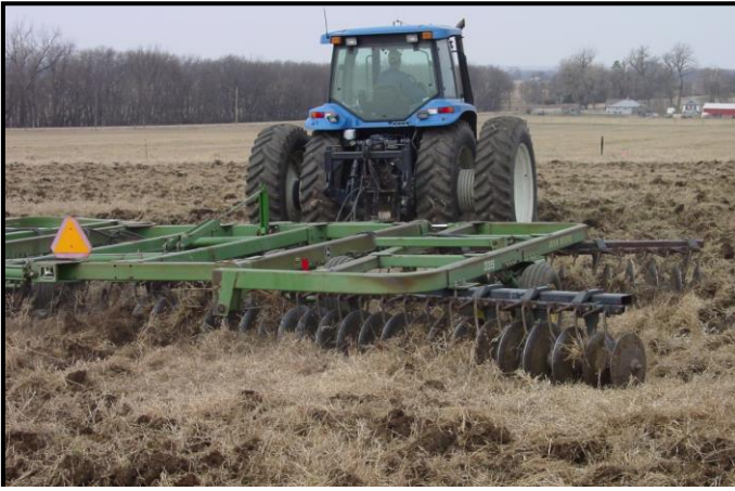
Brome Field Disking/Interseeding