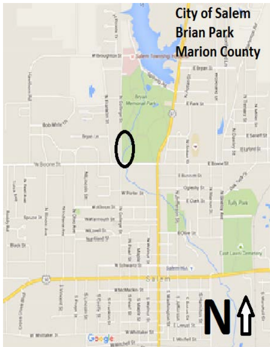
Example: Location Map (City)