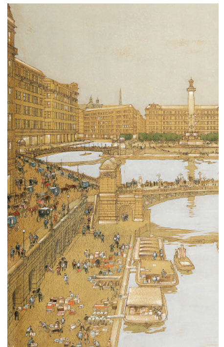
View looking north on the south branch of the Chicago River, showing the suggested arrangement of streets and ways for teaming and reception of freight by boat, at different levels. Plate 107, Plan of Chicago.

Arthur Melville Pearson is a freelance writer from Chicago.