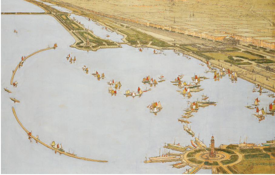
Bird's-eye view of Grant Park, depicting the façade of the city, proposed harbor and the lagoons of the proposed park on the south shore. Plate 127, Plan of Chicago.

Woods and Palos Forest Preserve to name a few. The plan also looked beyond Cook County to the “rising wooded land of DuPage County.” In 1917, the newly formed Forest Preserve District of DuPage County acquired its first 79 acres, and today holds nearly 25,000 acres. Subsequent forest preserve or conservation districts in Kane, Will, Lake and McHenry counties have preserved 170,000 acres—nearly three times as many as called for in the Plan of Chicago.