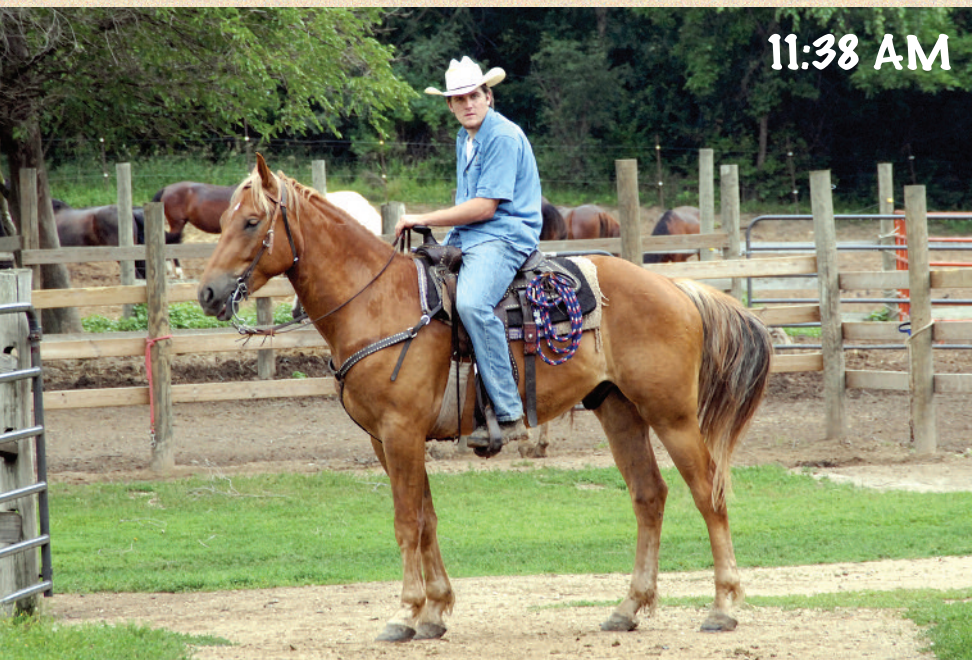
Another interesting destination on the trail is the Chain O'Lakes State Park Riding Stable, located near the park entrance. For a guided trail tour, horses can be rented at the park from May through October.