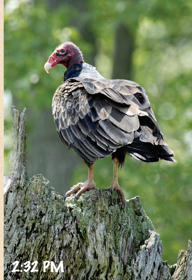
A turkey vulture wasn't fazed by hikers trekking down the 2.25-mile Nature's Way hiking trail that starts at Oak Grove Picnic Area.