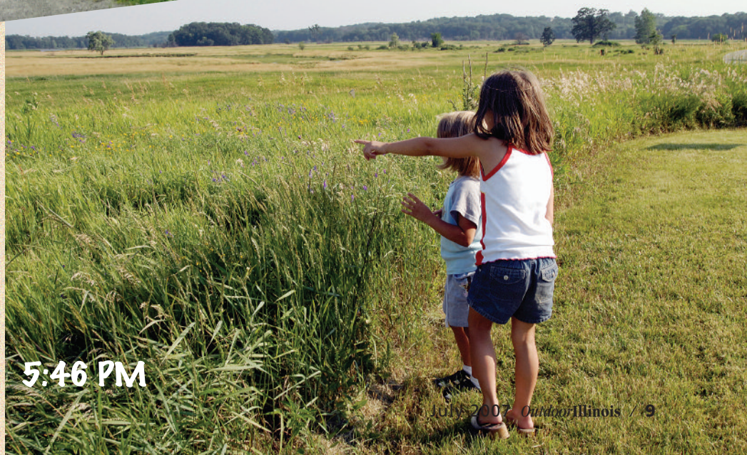
A scenic pull-off near the park entrance provides one last look across a wetland restoration project.