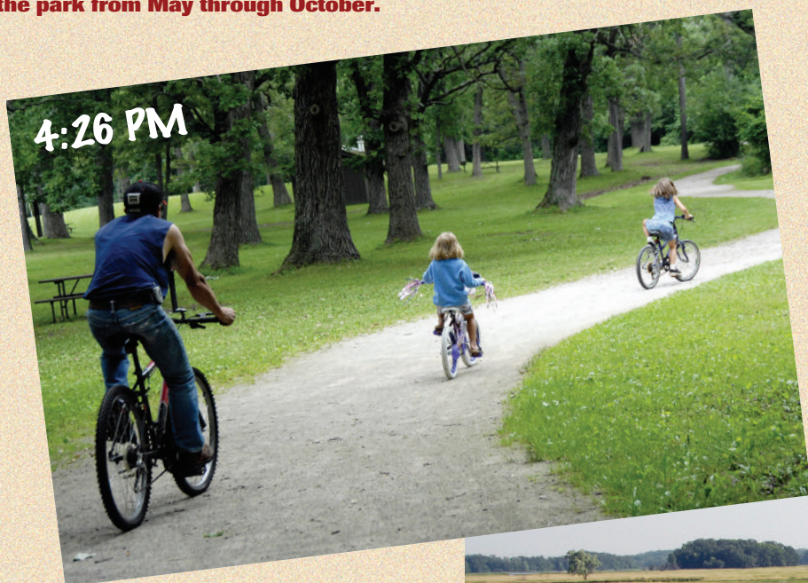
Bike trails at the park are easy enough for the youngster just transitioning from a training-wheel bicycle.