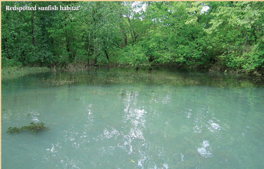
Redspotted sunfish habitat