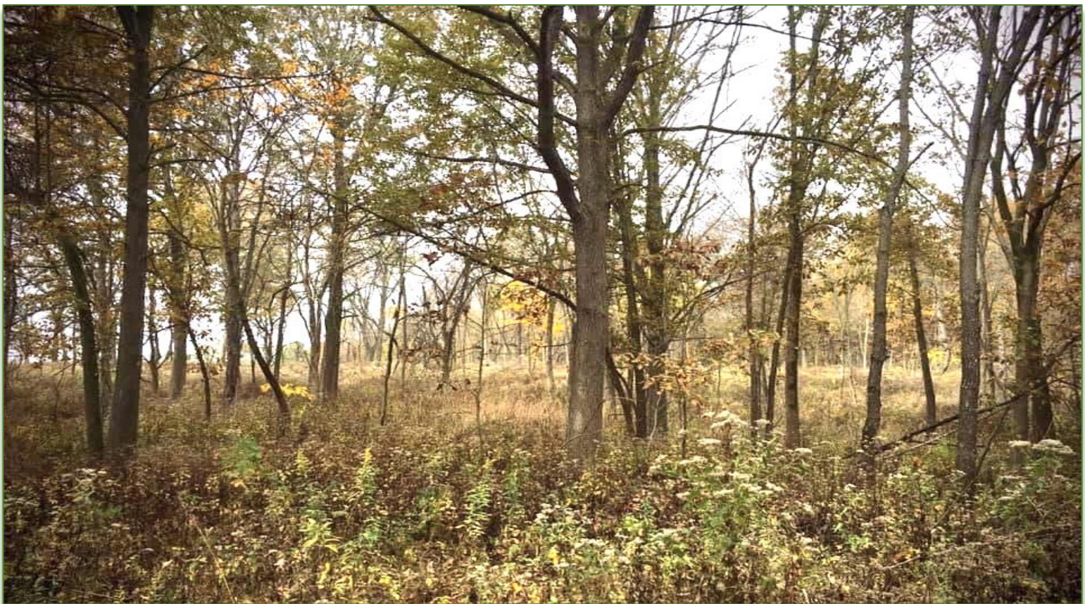
The results of spraying have been hailed by many landowners as “astounding”.

Not all acres can realistically be sprayed due to factors like proximity to residential areas or cropland, or impenetrable canopy. Creating a buffer between properties, however, can help alleviate concerns about drift. Many applicators are now taking advantage of the new market for aerial spraying of bush honeysuckle in the fall. Up until more recently, most applicators had the bulk of their work scheduled in the spring to do row crop pesticide application. Although there does exist some concern over private landowners attempting to employ aerial spraying contractors on their own (due to the various ecological factors determining the timing and efficacy of application), many of the pilots doing it now have worked with IDNR. Managers are therefore growing more confident about private contractors utilizing the practice in future.