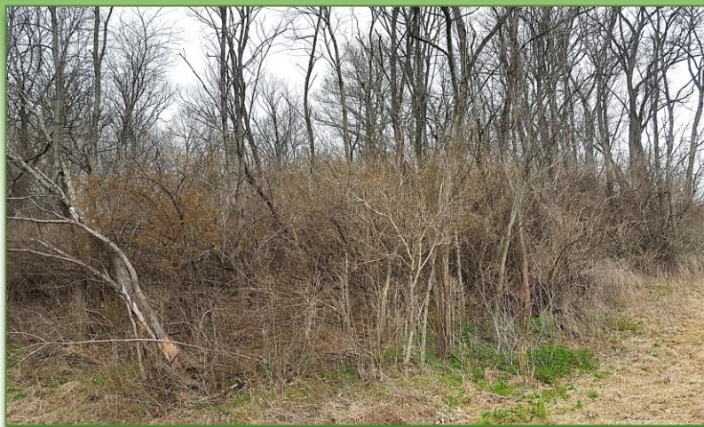
Post aerial spray of bush honeysuckle infestation

Indeed, one of the unique benefits of aerial spraying is that it can change the existing schema of removing invasive species first and applying Timber Stand Improvement (TSI) after. Up until more recently, it had been more common to apply TSI first, and then treat invasive species, which could cause issues when vegetation or debris in the wake of mulching and opened canopies restricted visual or physical access. Managers therefore began writing plans that called for removing invasive species before any trees could be thinned from the property, which can be a time-consuming process. Aerial spraying can conversely be applied before or after TSI is implemented, which may better ensure a better kill rate of invasive species.