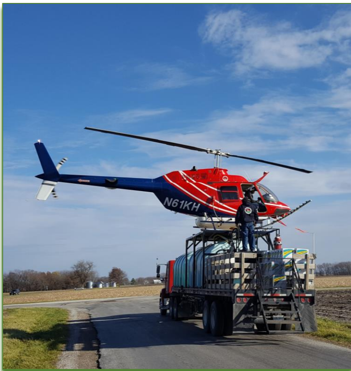
Helicopter filling up with chemical used to aerial spray bush honeysuckle

In order to effectively utilize aerial spraying, one must be sure to hit the leaves of the targeted species while they are still green and taking up nutrients, while also ensuring that the leaves of more desirable species like oaks, Christmas ferns and sedges are dormant. The best way to know whether the “window” is still open is to shake the branch of an invasive shrub and watch to see whether the leaves easily fall off the branch. If the leaves stay in place, the window is still considered “open”. One is advised to walk in at least 100 yards to check the leaves of plants in the interior rather than those along the edge. The window for spraying typically runs anywhere from early November to early December. Because aerial spraying tends to provide good “top-kill”, there may be smaller plants left behind beneath bigger plants. Spot treatments and subsequent spring prescribed burns are therefore often necessary, as both can kill smaller plants that may have been missed.