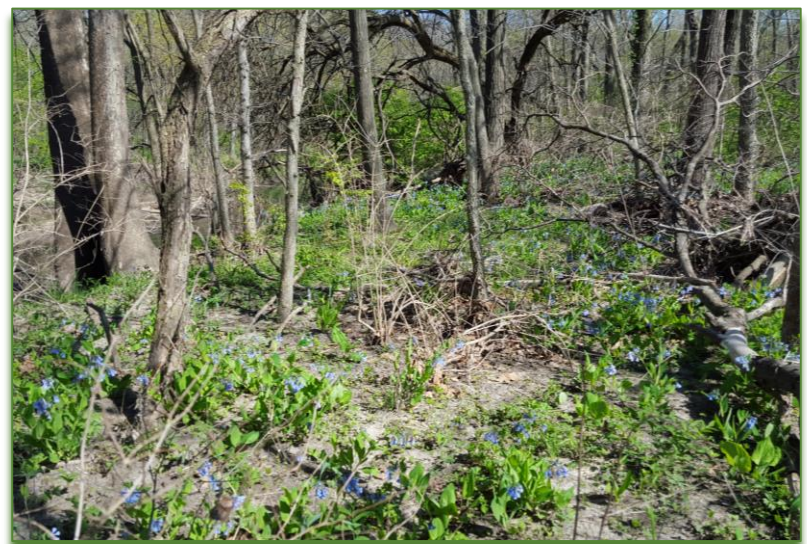
Virginia Bluebells spring to life after aerial spraying of bush honeysuckle giving immediate results

Another important factor in aerial spraying's growing use and popularity is its visual "wow-factor". While the prospect of aerial spraying may initially cause concerns among some landowners about damages to crops or residential property, many who were initially skeptical tend to change their mind after seeing the profound results of aerial spraying. Aerial spraying offers the chance to make a real, lasting dent in the effort of clearing and maintaining the quality of one's timber. For some, this can offer hope and address the feeling of demoralization experienced by many when faced with the overwhelming task of removing persistent, invasive bush honeysuckle from a large area. There is nothing worse than returning to a site that has been treated manually or mechanically, only to see it looking much the same as it did before because of lack of continued maintenance. Aerial spraying can also address the desire most landowners have to see immediate results.