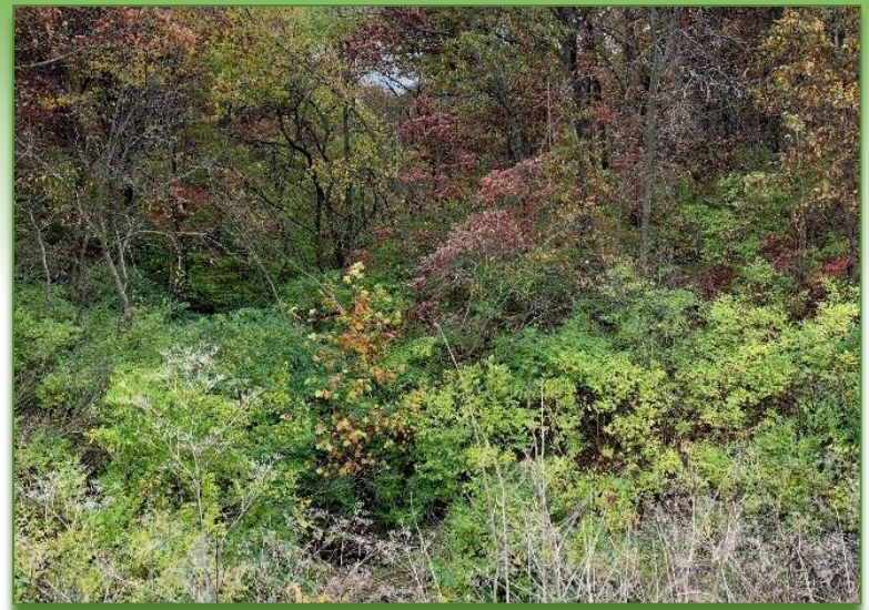
Some infestations are so thick that landowners feel overwhelmed by the prospect of having to treat it.

Landowners are introduced to aerial spraying through the IL Forestry Development Act (IFDA) cost-share program in much the same way. The IFDA cost-share program operates much like the Conservation Stewardship Program (CSP), in that when landowners enroll, they are expected to provide an IDNR-approved forest management plan and implement it, for which they will receive cost-share assistance. (CSP, however, operates on the basis of providing a tax-break). Prior to 2017, exotic plant removal was not written into the IFDA cost-share program's administrative rules (as invasive species were not as much of a problem at the initial launch of the program). IFDA management plans are often a reflection of District Forester (DF) expertise and private consultant resources and cost-analysis. However, a DF may recommend aerial spraying after looking at a management plan or talking to a landowner who has a heavy infestation of bush honeysuckle. Private forestry consultants may also recommend aerial spraying.